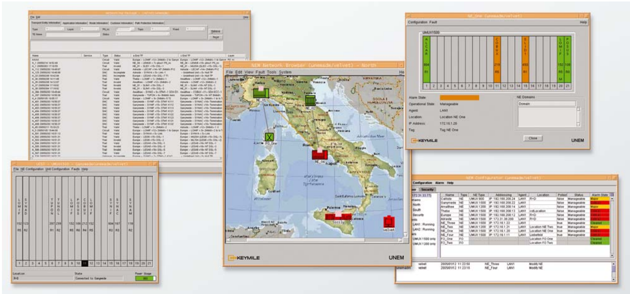
Simple configuration, fault management and visualisation of your network topology

Service provisioning The configuration of the various network and service parameters in the network elements is performed through the intuitive configuration view, enabling the fast and efficient provisioning of new services.